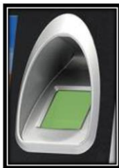
High Power DSP

Hot model PLF-S1000 is popular in the market with smart design, improved function that support WIFI, access control, bell, battery, RFID. Professional communication port with Wiegand in & out, 2 x relay, NC, NO, alarm, etc. Device with silicone keypad and ring bell. Data be managed via TCP/IP, Wi-Fi, and USB host port for data up / download to avoid the risk of accidental deletion, what's more, friendly software eTime with free.